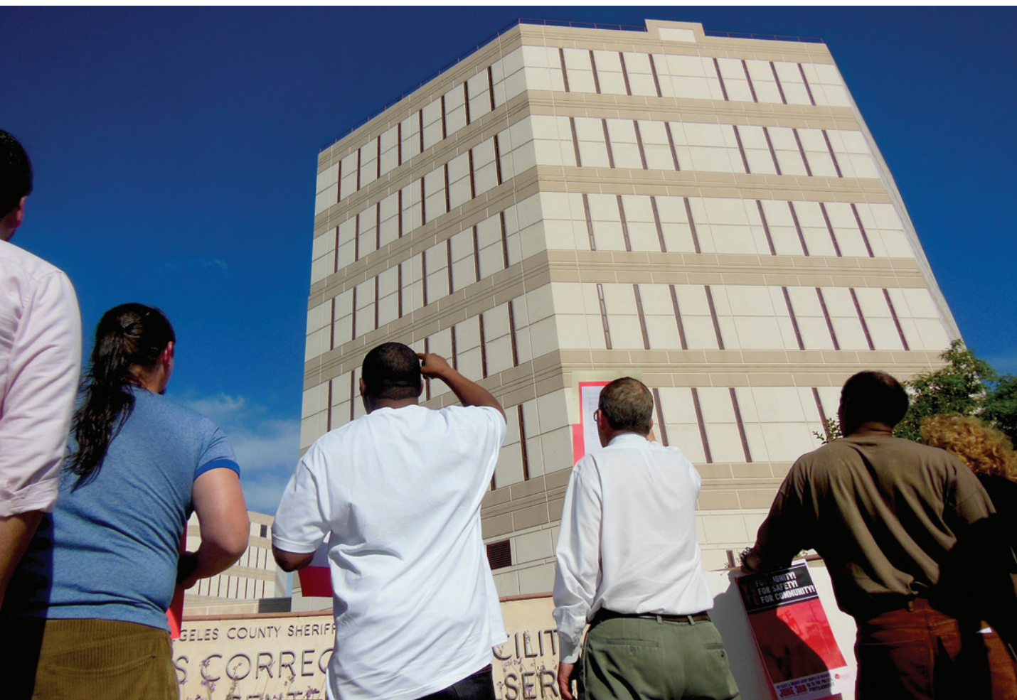
Members of the Coalition to End Sheriff Violence in LA Jails, a project of DPN, hold an action outside of the Twin Towers Correctional Facility; which is considered to be the largest mental health treatment facility in the country. Both Cook County Jail (Chicago) and Rikers Island Jail (New York) are comparable in the size of their population of prisoners with mental health conditions. The Coalition is calling for civilian oversight of the Sheriff's Department.

Failure to adequately implement preventative measures in treating mental health conditions, a lack of significant diversion programs for those incarcerated in local jails, and the prioritization of jail construction constitute human rights violations which are felt most acutely in Black communities reinforcing persistent racial disparities in LA County and nationwide.